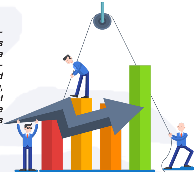
Challenges of Branch Operation